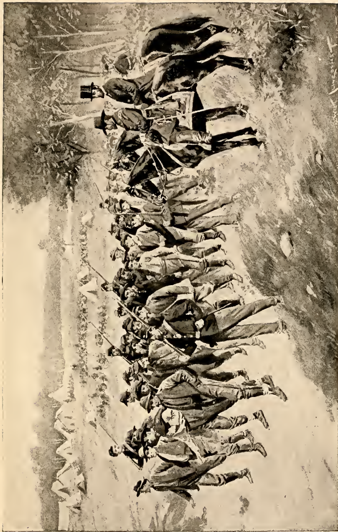
PRESIDENT LINCOLN AND GENERAL GRANT INSPECTING A BODY OF PRISONERS